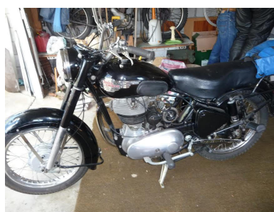
1954 Bullet 500

Sadly, still no news on the two stolen Royal Enfields from Cambridge