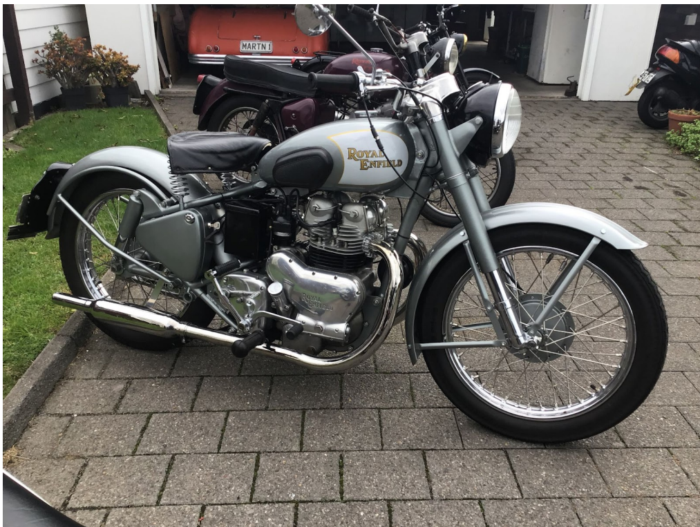
Only have 300 miles on the clock - but just running so sweet (Lew)