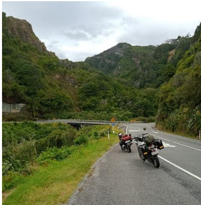
The road up the Cest Coast.