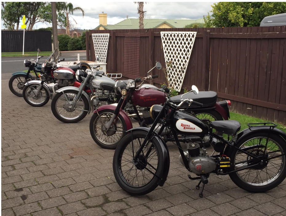
L-R. 52 350 Bullet. 59 Meteor Minor.Sport. 52 500 Twin. 65 Turbo Twin. 52 RE2 (49 Model G in the workshop, and I have Just purchased a 1951 Trials Bullet) project)