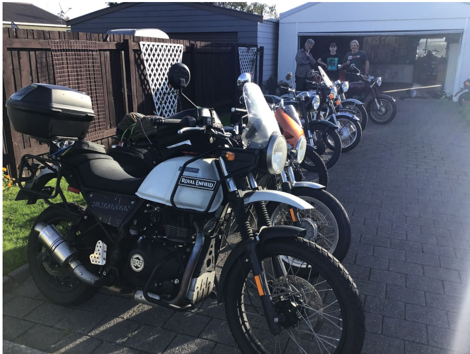
Chris Blenkinsopp's Himalayan at front of line up