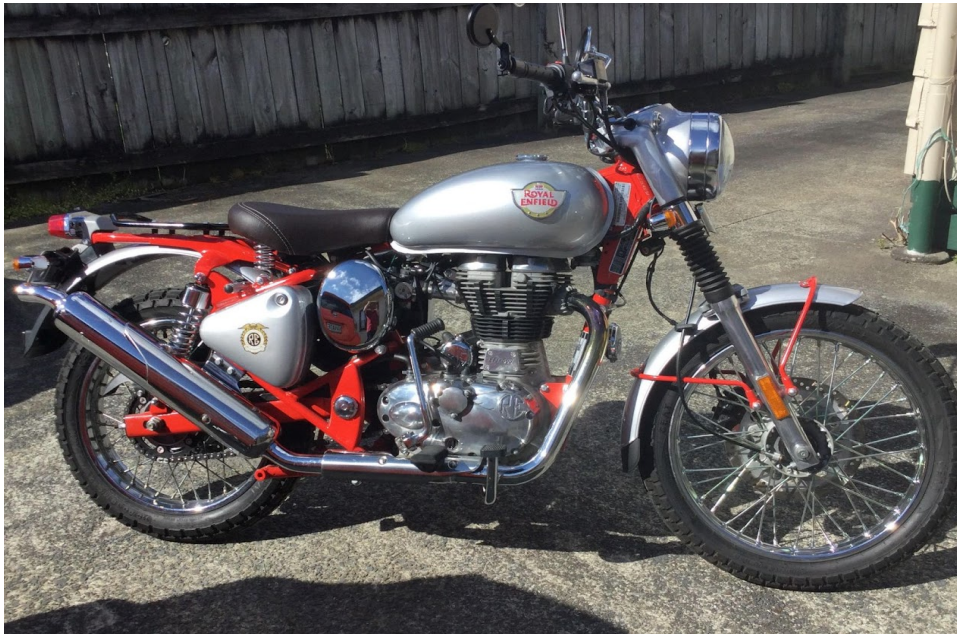
Paul Tottie -- 2021 Trials Replica