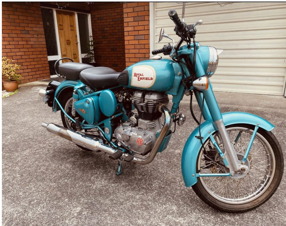
Tapan Kadakia -- 2010 Bullet Classic 500