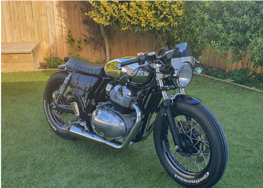
Kevin Lake -- 2019 Continental GT 650