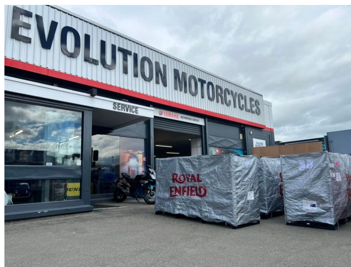
NEW RE DEALERSHIP IN PALMERSTON NORTH